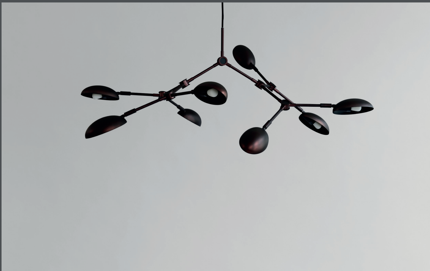
DROP CHANDELIER MINI - BURNED BLACK