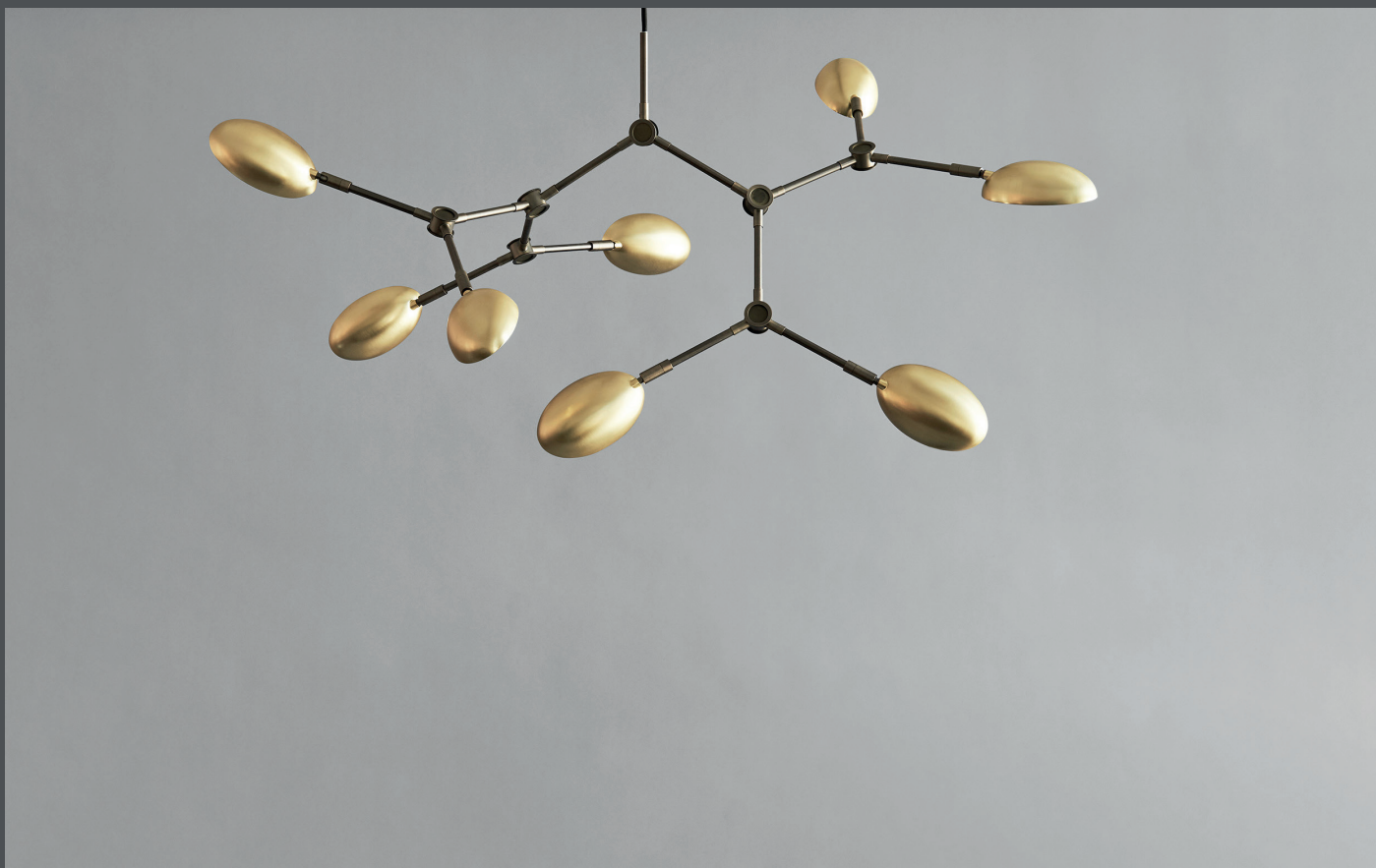
DROP CHANDELIER MINI - BRASS