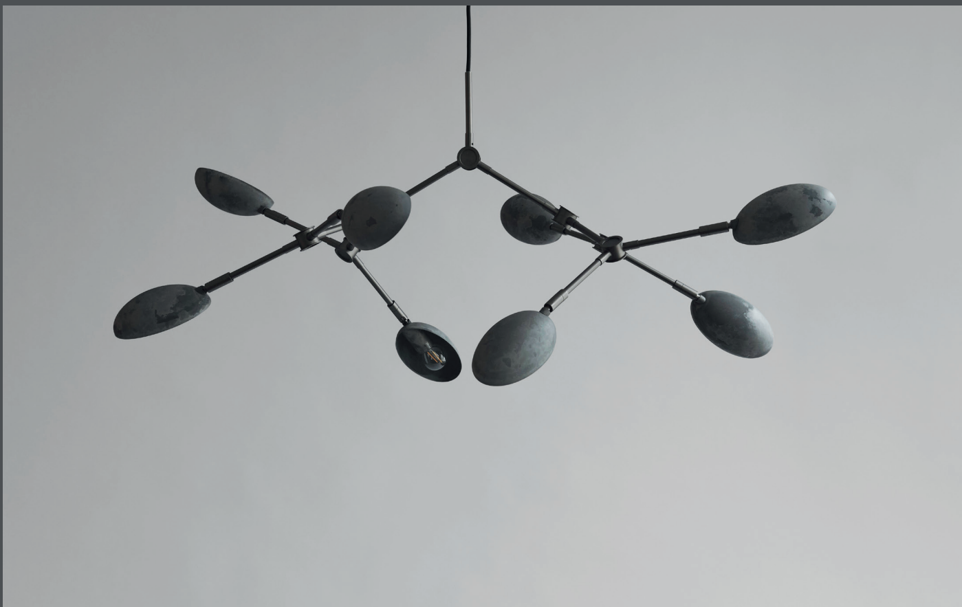
DROP CHANDELIER MINI - OXIDIZED