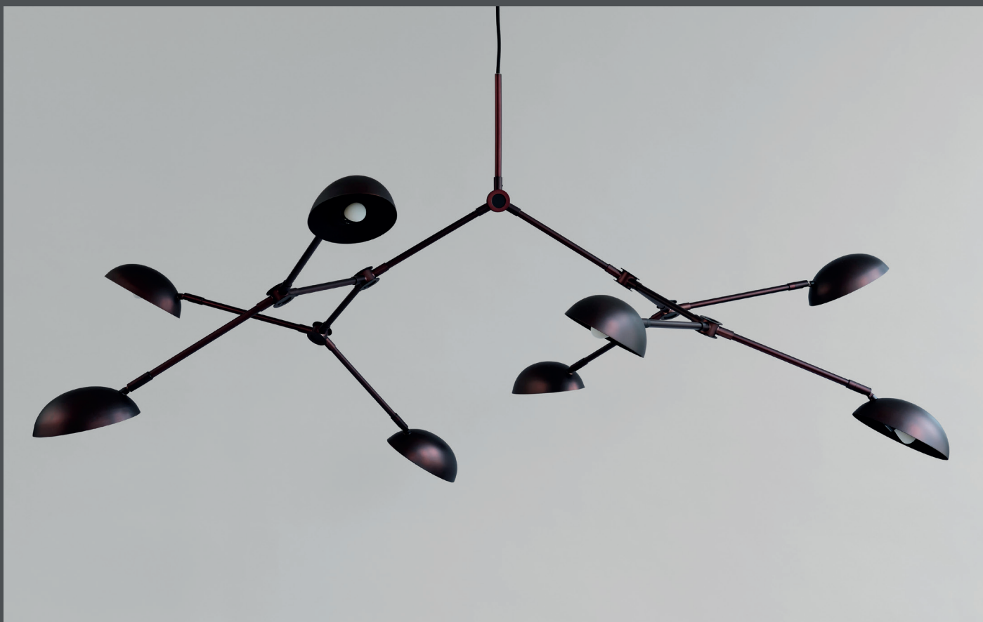
DROP CHANDELIER - BURNED BLACK