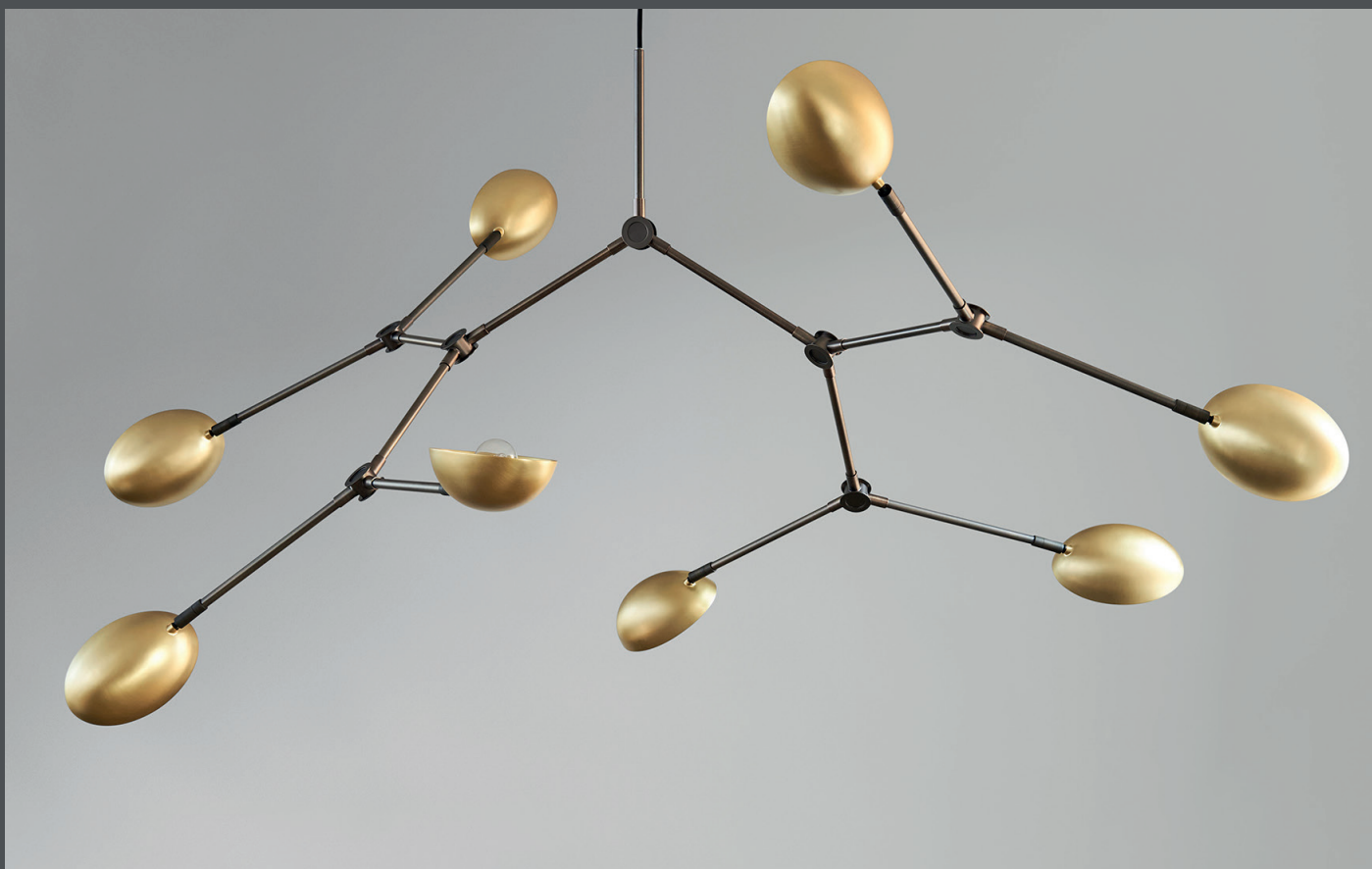
DROP CHANDELIER - BRASS