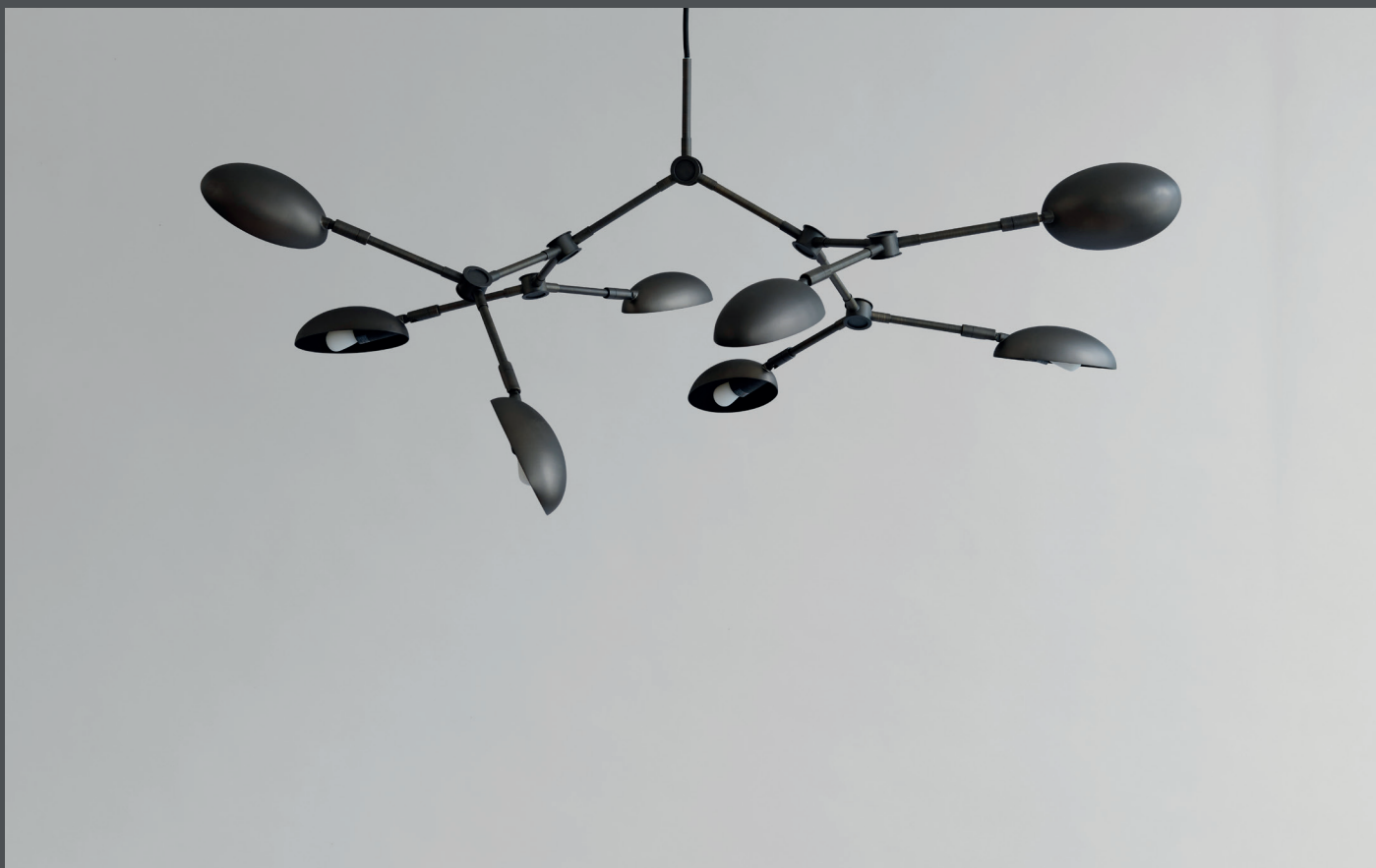
DROP CHANDELIER MINI - BRONZE