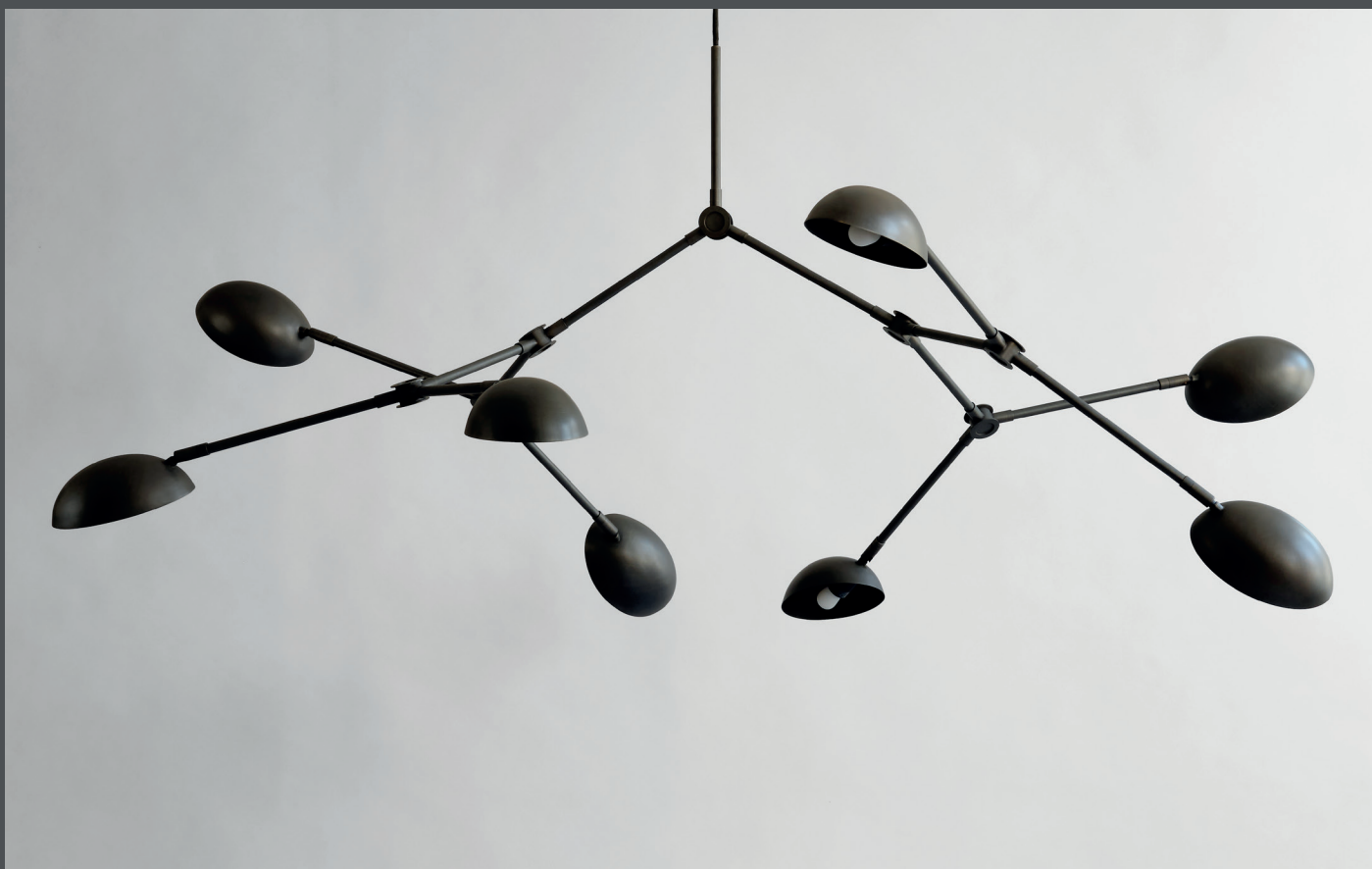
DROP CHANDELIER - BRONZE